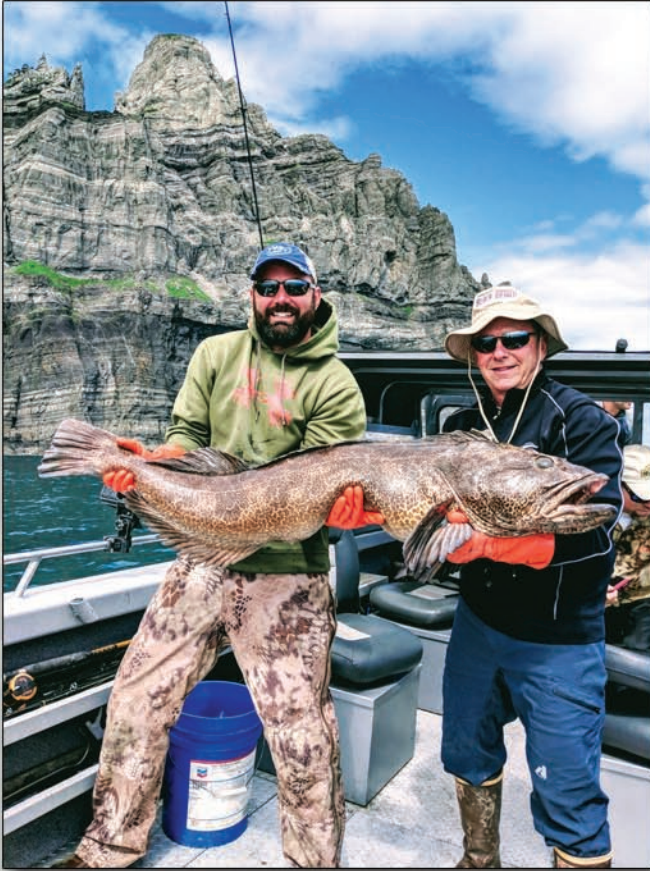
54 pound Ling Cod with Castle Cape in the background

2018 did present some challenges as the Chignik River King run was weak again. We were fortunate to have tight lines and great fishing for all our other species. We are anxious for the King's to fill our river and return to our past fishing expectations.